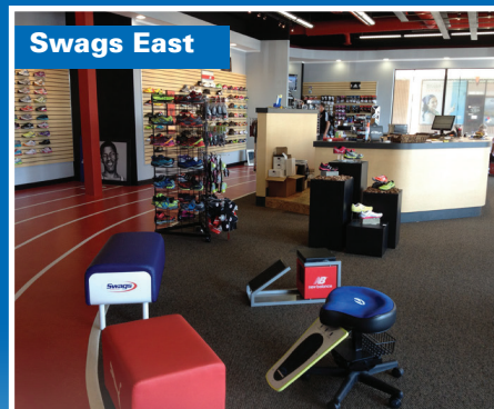
Swags East 9407 Westport Rd 502.749.7924