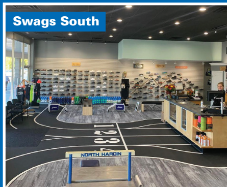
Swags South 7415 3rd Street Rd 502.368.2443

The Run 4.0 CEP compression socks deliver unmatched excellence in their fit, feel and performance. And at Swag's Sport Shoes this is what we are committed to providing our customers. We make sure all runners find the perfect fitting running shoe, the perfect running socks, and all at the perfect price. So don't cut your run short, visit Swag's Sport Shoes for all your running needs.