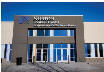
Westport Plaza, Suite 129 9451 Westport Road Louisville, Kentucky

Norton Sports Health Performance & Wellness Center caters to all levels of fitness, offering progressive training programs to enhance fitness or sports performance and boost team camaraderie. Programs include LIFeready and Senior LIFeready for adults and SPORTready for third through 12th grade, as well as RETURNready for athletes looking get back to 100% after injury. In addition to coach-led fitness classes, the facility offers yoga, open gym, performance nutrition packages, and baseball and softball pitching and hitting group lessons for youth athletes. Interested in signing up your entire sports team or individual athlete for classes? Call (502) 409-8888 , email NSHPWC@nortonhealthcare.org or visit NortonSportsPerformance.com .